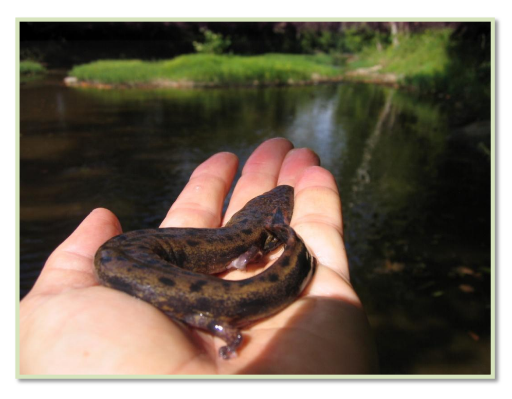
Figure 3. Stressed mud puppy observed on Dunkard Creek during kill event, September 10, 2009.

• Monitor by observation and, if necessary, facilitate natural restoration by transplanting mudpuppies from other populations if possible.